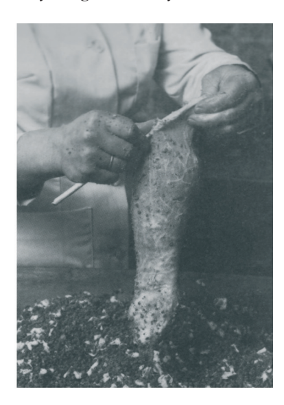
Fig. 3. The production of sausages: The sausage is stuffed, a sausage pin is inserted to close the sausage casing, and the sausage is dried or smoked for storage. (Photo: Jan Haug, Hedemarksmuseet, after Birthe Weber 1990).

In horizon 5, some 730 objects were classified as sausage pins; this comprises about 8% of the total number of artefacts assigned to this horizon. The sausage pin is not complex in form, and it is thus possible that some may have been incorrectly classified.<sup>3</sup> However, since we are dealing with such a large number of objects, it is likely that the true number of sausage pins is still very high<sup>4</sup>.