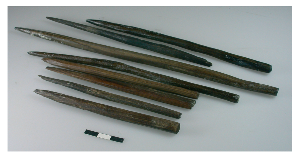
Fig. 2. Sausage pins. (Photo G. Hansen).

There are at least three steps from the production of a sausage to consumption. Having butchered and dressed the animal, meat and entrails are chopped and filled into the sausage casing. The casing is then closed with a pin, and the sausage is dried or smoked for storage. The second step is storage of the sausage, and the third step is serving and eating the sausage. I find it most likely that the sausage pin was taken out of the sausage before it was served and eaten. At this point the pin would have outlived its purpose and could be reused in the household where the sausages were made. This would be in accordance with the ethnologically documented reuse of the pins. On this basis, I assume that a sausage pin recovered from an archaeological context signifies a site of sausage-production or storage, rather than its place of consumption.